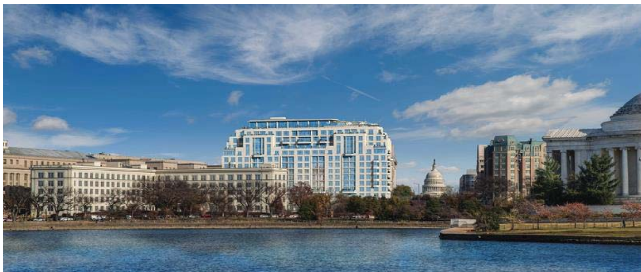
Developer Capital Program - The Portals