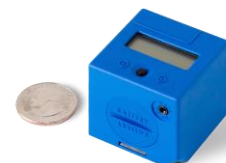
DPP® Micro Reader