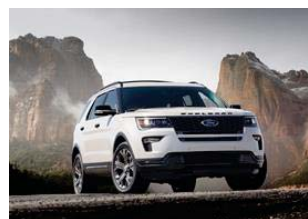
2018 Ford Explorer

Our new 2018 F-150 just went on sale. Order banks are showing 54 percent of customers requesting Lariat, King Ranch, Platinum and Limited series trucks, with 88 percent in SuperCrew and almost 60 percent equipped with our 3.5-liter EcoBoost® V6.