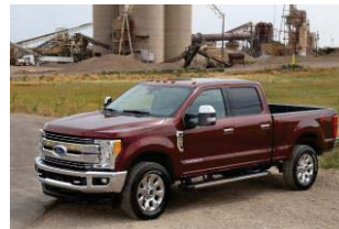
Ford F-Series Super Duty

Customers continue to favor high series Super Duty pickups. Last month, average transaction pricing for Super Duty moved above $55,000 per truck – a $5,500 increase. This is $7,000 more than the average transaction pricing of the luxury segment, at $48,000.