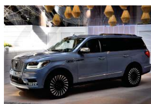
2018 Lincoln Navigator

Explorer retail sales rose 6.1 percent last month. We’re seeing continued growth, particularly in the larger east coast markets, with Boston sales increasing 10 percent, Philadelphia up 21 percent and a gain of 18 percent in the country’s largest SUV market – the New York area.