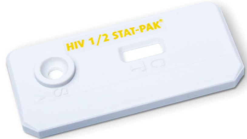
Chembio HIV 1/2 STAT-PAK®