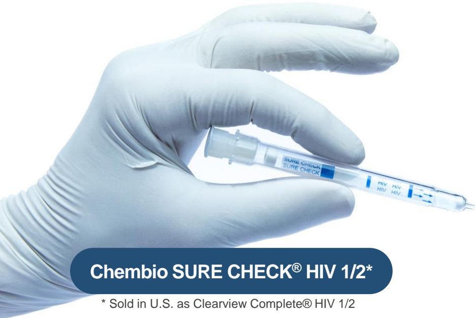
Chembio SURE CHECK® HIV 1/2*