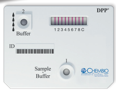
Chembio's Dual Path Platform (DPP®) Patented in 2007